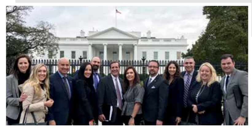
▲GPCC Delegation at the White House

The GPCC delegation learned that a bipartisan stabilization package will be key to reigning in health care expenses. Specifically, certain aspects in health care that need to be reevaluated such as the cost sharing reductions and changes to how it is financed. Arizona's congressional representatives discussed possible solutions that can improve health care including broadening the definition for chronic conditions in high deductible plans, allowing organizations to band together for group plans and extending the time for short-term plans up to one year. Lawmakers also suggested that a marketplace health care industry may empower patients financially. Many expect Congress to revisit this issue sometime early next year, and GPCC will continue to advocate for common sense reforms that don't shift costs onto employers.