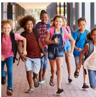
Education & Family

*Discounts available for bulk package purchases.