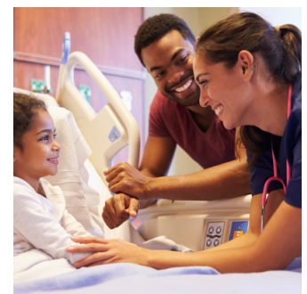
Health Care & Special Needs